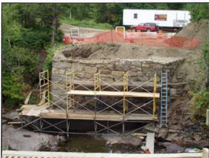
Greenbanks Hollow Bridge abutment.

Work started July 23 when the contractor began the process of rigging the bridge for the lift off its abutments. On July 26, the bridge