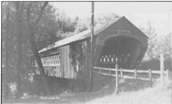
Old Pompey