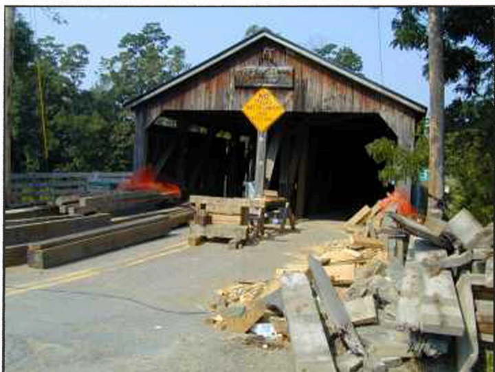
Pulp Mill Bridge. Aug. 14, 2002

Poor, valiant bridge. I traveled it yesterday. In evidence are some new timbers and some new decking at the Middlebury end and traffic. Lots of traffic! □