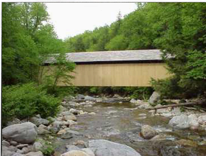
Brown Bridge Repaired