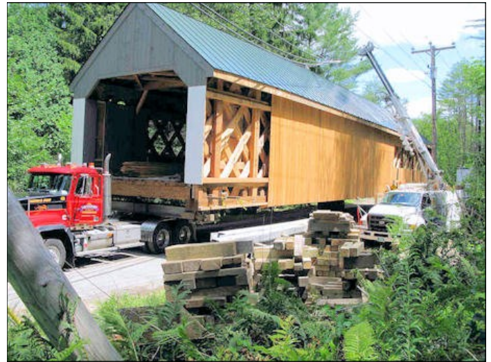
Williamsville Bridge replica backs under cables