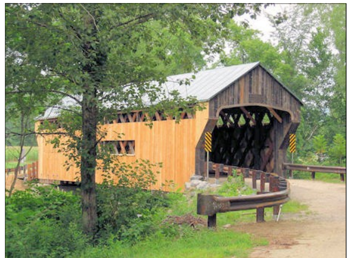
Worrall Bridge renovation completed – photo by Ray Hitchcock, August 5, 2010

I was away when the bridge was completed but I assume it was before the end of July - which was the deadline. I drove across the bridge on August 5th and was all smiles.