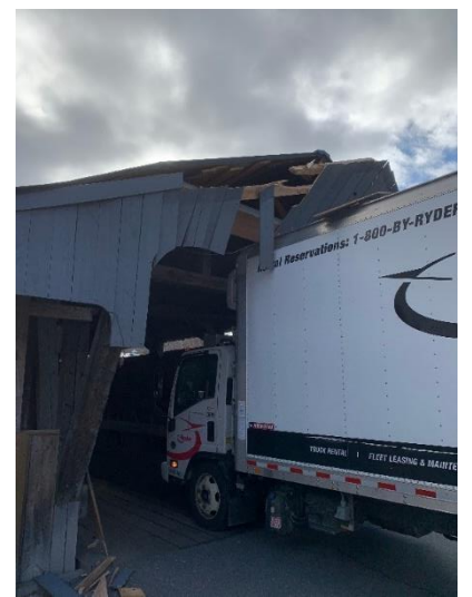
Truck stuck at a covered bridge in Waitsfield, Vt.

truck was 2 feet tall than the covered bridge's clearance. The result was damage to the bridge's roof and its supports. The truck also exceeded the 3-ton weight limit on the bridge.