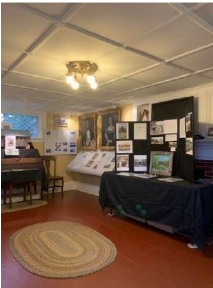
Brandon Museum Display