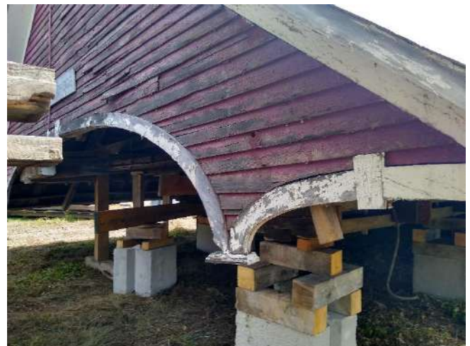
Sandborn CB in storage

The Sandborn CB has seen lots of activity lately. In preparation for potential flooding from Tropical Storm Debby, Miles Jenness of Vermont Heavy Timber (also chair of the VCBS Bridge Watch) and crew stripped siding off the bridge to allow water to flow through if it got that high. The bridge was also secured to the riverbanks with cables. Fortunately, the August 9 th storm did not cause flooding or damage to the bridge. Since that time, Miles Jenness and crew have completely dismantled the bridge and stored it for restoration. Work to restore the bridge will hopefully start in 2025.