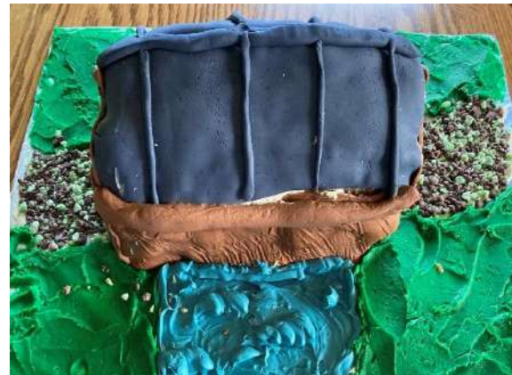
Covered Bridge Cake by Charlotte 4-H