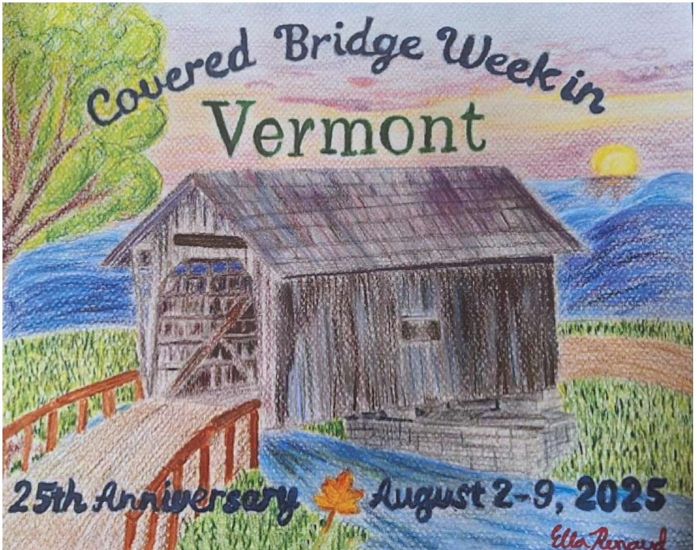
Winning poster from poster contest by Ella Renaud