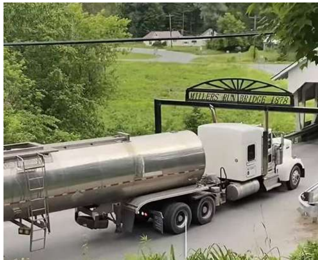
A tractor trailer being stopped by new crash barriers at the Miller's Run Covered Bridge.

Miller's Run Covered Bridge – Lyndon – In multiple incidents over the last several months, the recently installed bridge barriers, or headache bars, at the Millers' Run Covered Bridge are doing their job to protect damage to bridge. One incident occurred on June 19 th when the exhaust stacks of a tractor trailer struck the newly installed barriers. Minimal damage was done to the truck which backed away and no damage was done to the bridge.