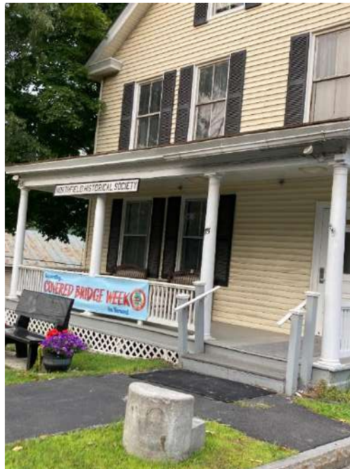
Northfield Historical Society