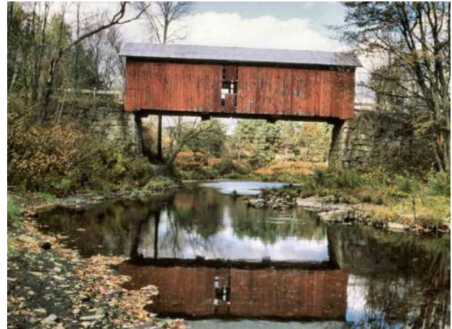
Slaughterhouse Covered Bridge

practical to close the bridge for repairs. Miles and his team from Vermont Heavy Timber were able to do emergency stabilization work to the bridge to prevent a collapse and closure of the bridge.