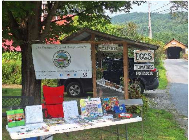
VCBS at Bartonsville Covered Bridge. If you have the 2026 calendar for the month of July, this scene should look familiar