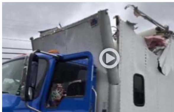
Damage to Box Truck

Then on August 25 th , a box truck attempting to navigate the bridge hit the barrier taking about 6 feet of the truck roof off and damaging the barrier. The driver of the truck was following her GPS and ignored the warning signs posted on the way leading up to the bridge.