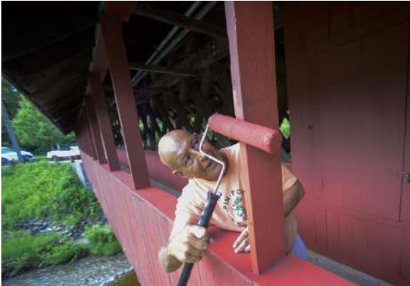
Dick DeGray painting

Bridge. They assisted the Public Works and the Recreation Department of Brattleboro to get the job done. The new coat of paint was just in time as VCBS celebrated Vermont Covered Bridge Week on the bridge.