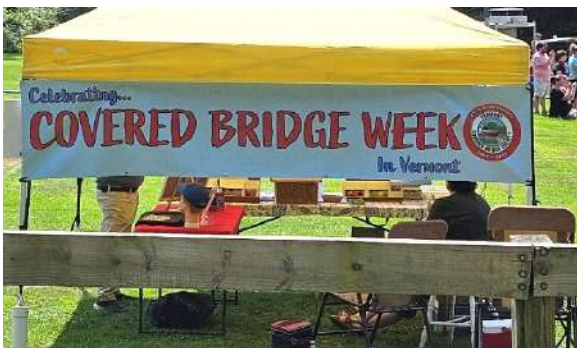
VCBS booth in Pittsford