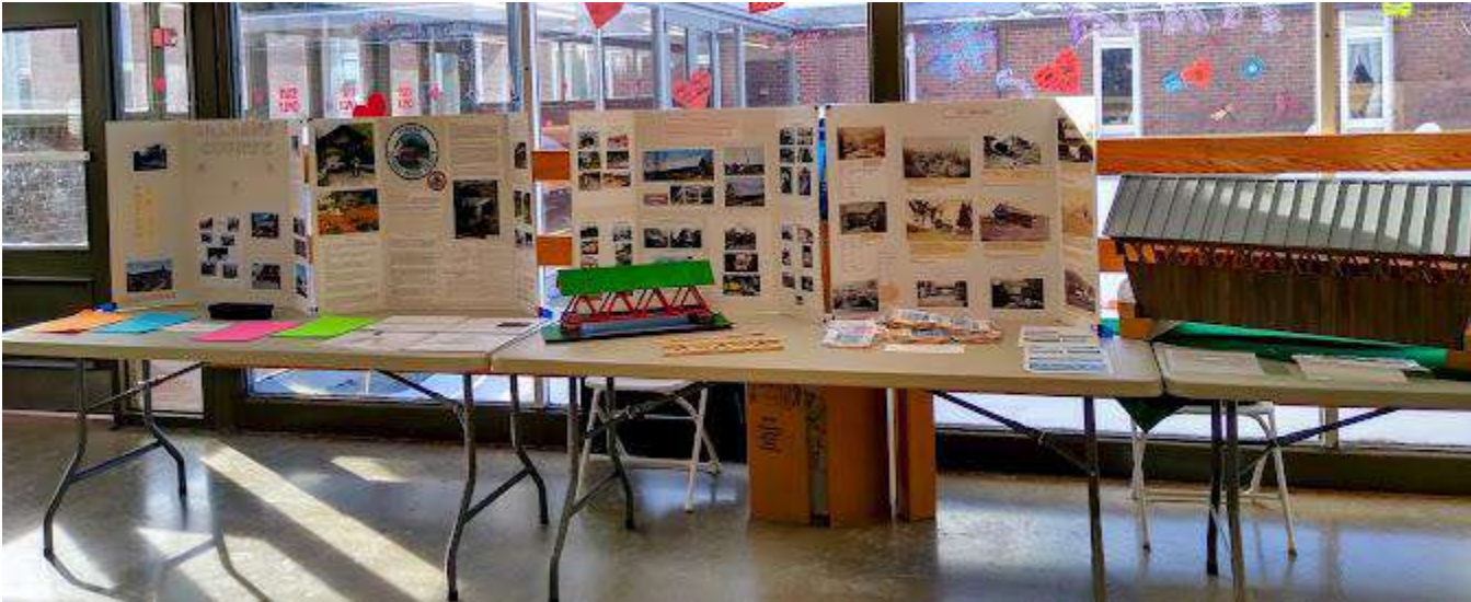
VCBS display at North Country Supervisory Union Middle School Science Fair