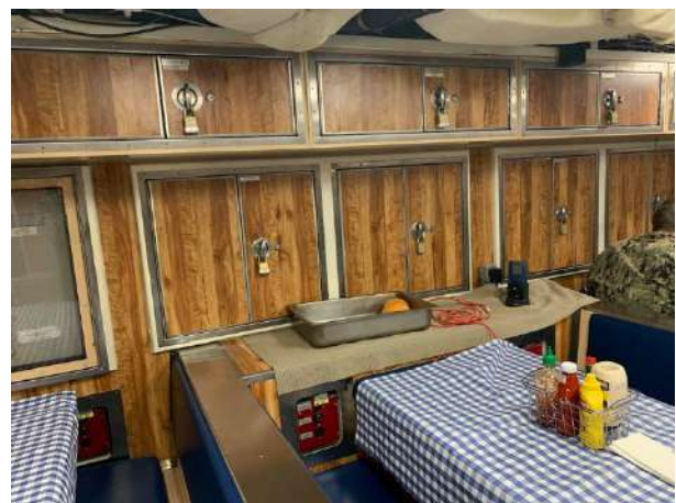
The Catamount Tavern pre-decorated cabinets – https://sites.google.com/view/vtssn792cc/about-the-boat