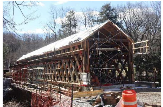
Kingsley Covered Bridge as it looked on 3-19-24.