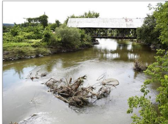
Timber-frame builders Vermont Heavy Timber take measurements to protect the Sanborn Covered Bridge against flooding on Thursday, Aug. 8, 2024. The work was done on an emergency basis ahead of Tropical Storm Debby.

LYNDON – State officials have ruled that reconstruction of the Sanborn Covered Bridge will require an Act 250 permit, citing design changes and potential impacts tied to a nearby, contested development along the Passumpsic River.